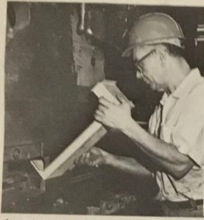
A complete sheet metal fabrication shop which relies on the most modern equipment . . . . .

SOLARTEMP's Customaire Metal Specialty Company has one of Delaware Valley's most complete sheet metal fabricating facilities. Housed in a shop of over 25,000 square feet is a wide range of major equipment used for metal fabrication of stainless steel, galvanized steel, copper and monel. Working in conjunction with the engineering staff of SOLARTEMP, Customaire manufactures equipment designed for heating, air conditioning and industrial processes.