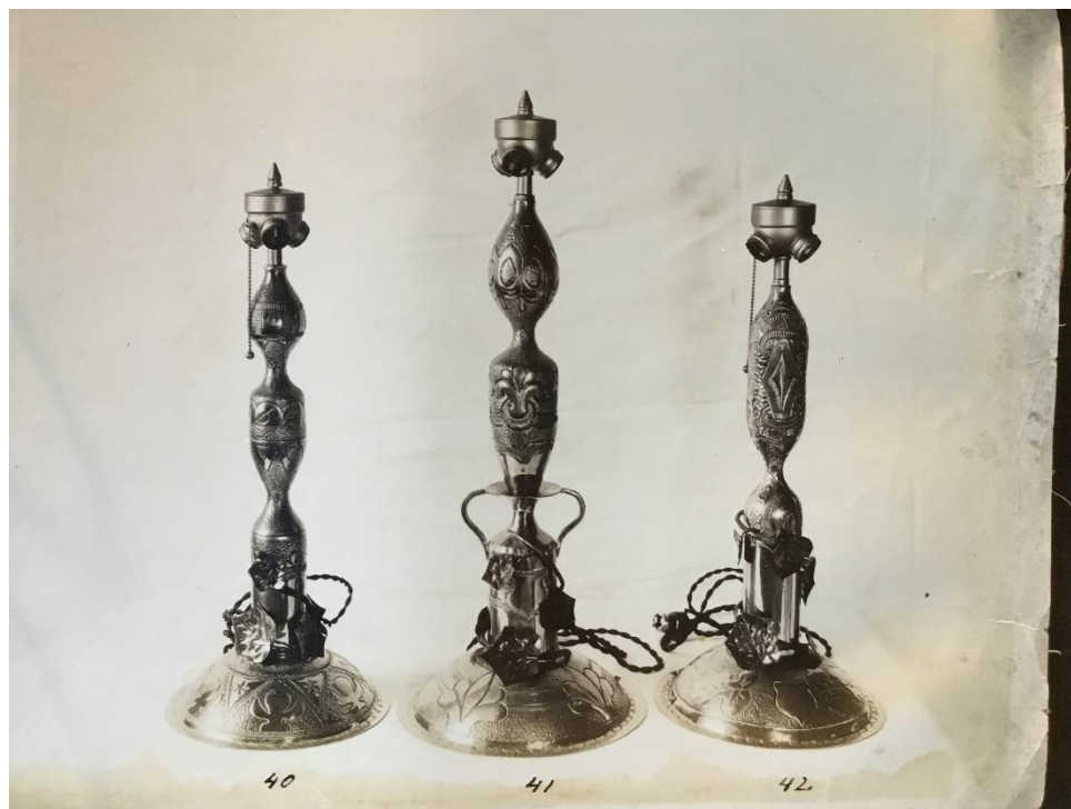
Below are table lamps and jardiniere that were crafted by Victor A. in his spare time.